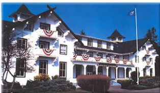
Fort Lewis Museum

Holmes strives to provide the highest customer satisfaction and lowest installed cost!